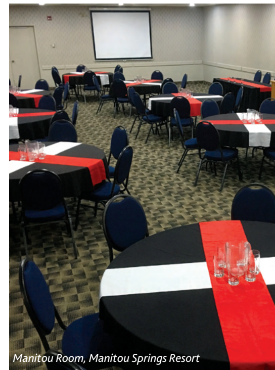
Manitou Room, Manitou Springs Resort

Those looking for a more relaxed venue can check out the Regional Campground at Manitou Beach. With more than 200 sites